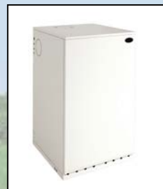
Senator Condensing Combi