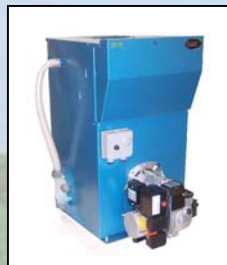
Consul Condensing Boiler House