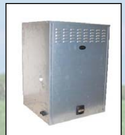
Countryman Condensing Outdoor Combi