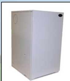
Ambassador Condensing Kitchen