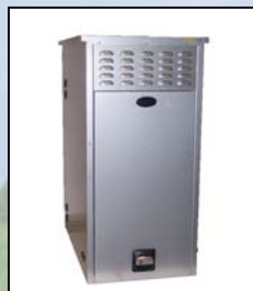
Countryman Condensing Slimline Outdoor